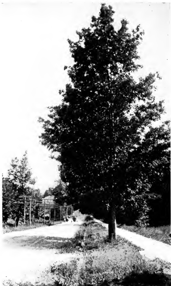
FROM BEULAH TO BENZONIA